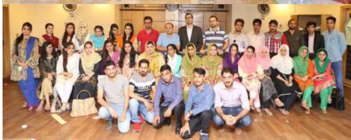
Disaster Management Training Islamabad, 19 & 20th August, 2017

The primary beneficiaries of this program are youth of AJK, particularly those studying in universities. It has been observed that youth in AJK lack knowledge, skills and platforms to act as first response in any type of disaster. Therefore, KIIR is making efforts to develop a cadre of equipped and motivated men and women that can quickly join hands with local disaster response mechanisms as