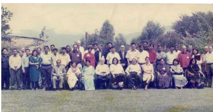
Conflict Prevention Meeting in Katmandu 2003

In the past twenty-five years, KIIR made conscious efforts to improve appreciation of Kashmiri perspectives and enhance understandings among various actors. By