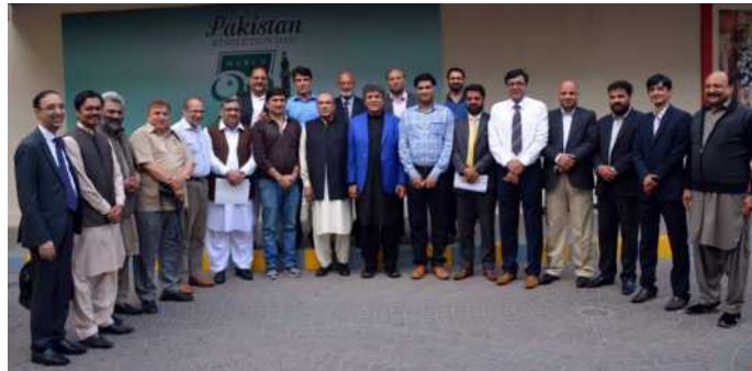
Media conference 26 -27 March, 2017 at Falaties Hotel, Lahore

Keeping in view these challenges and needs, KIIR has been regularly contributing towards creating an environment of learning, professional growth and setting of standards to enhance quality of journalism in the region. Through dialogues, workshops, conferences and trainings - the