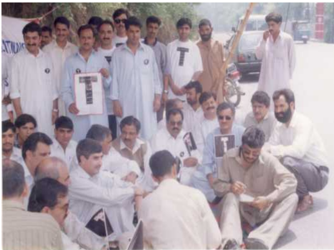
Sit-in on International Torture Day 1999 at Muzaffarabad

At home, KIIR organizes conferences, seminars, and workshops to educate local communities and highlight the plight of people of Kashmir. The organization provides means of peaceful expression to political activists, scholars, and students on the Kashmir cause.