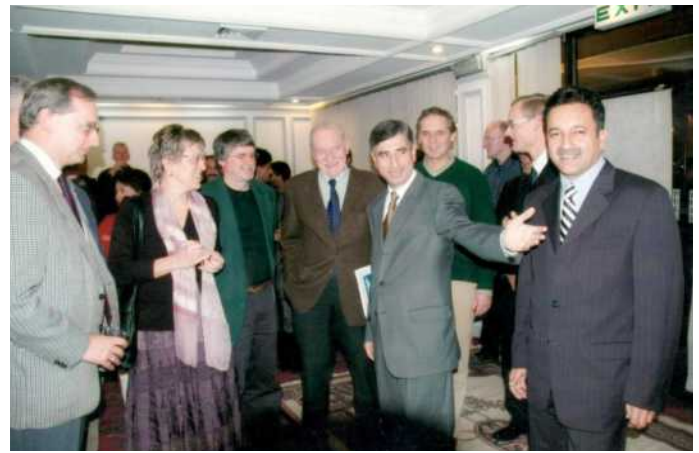
Meeting with diplomats after earthquake 2005

successful in providing spaces to participants for sharing of ideas and experiences. KIIR believes that such interactions are needed in order to build an environment of sustainable dialogue among Kashmiri people for strengthening the ongoing efforts for peace in South Asia. It is important to remind ourselves that the Kashmir dispute should be resolved in-line with the aspirations of Kashmiri people by extending their right to self-determination.