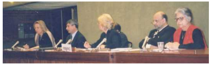
Human Rights Council Geneva

At home, KIIR organizes conferences, seminars, and workshops to educate local communities and highlight the plight of people of Kashmir. The organization provides means of peaceful expression to political activists, scholars, and students on the Kashmir cause.