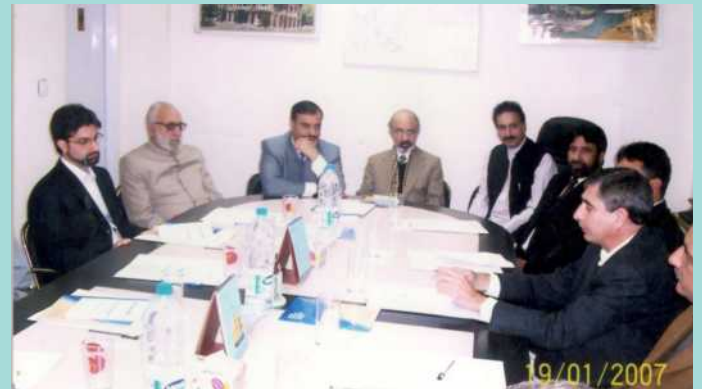
Chairman APHC Mir Waiz Umar Farooq a KIIR, Jan 2007