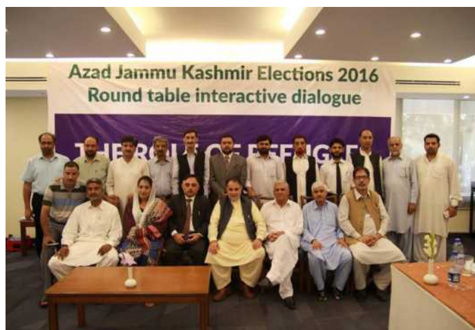
AJK Elections 2016 Round table interactive dialogue 5 June 2016