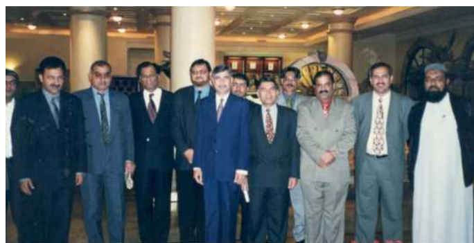
KIIR Delegation to South Africa 2003

Kashmir in the past twenty-five years including political parties, think tanks, universities, human rights activists and