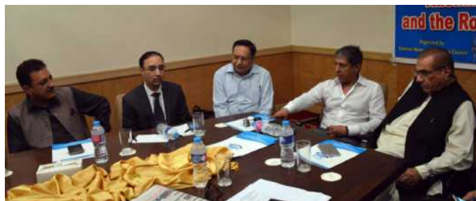
Media conference 26 -27 March, 2017 at Falaties Hotel, Lahore

Building upon this success, a major development was formation of joint platforms for journalists in the Kashmir region. The objective was to share news, conflict-related reports and concerns about journalist's safety. Creation of 'Jammu and Kashmir Joint Media Forum' in 2018 opened doors for greater interaction between journalists working in all parts of Kashmir.