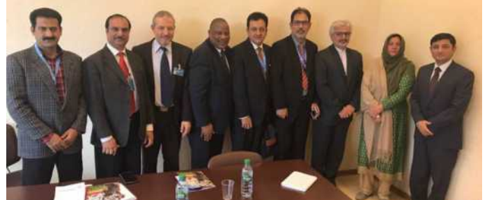
Kashmiri Delegation with Commissioners of OIC Independent Permanent Human Rights Commission at Geneva 2017

At the International level, Kashmir Institute facilitates seminars and conference in Geneva and other places on different subjects of human rights, inviting leaders of International stature and International human rights experts to express their feeling on the human rights situation of Indian occupied Kashmir.