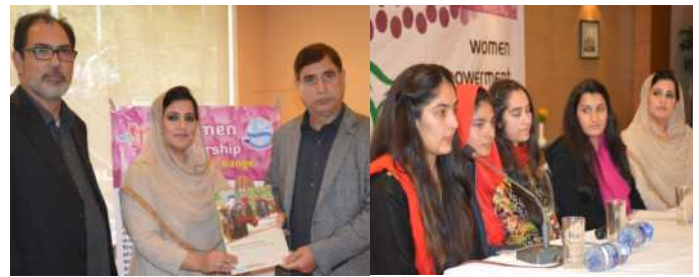
Celebrating 5-Years of Women Empowerment Initiatives by KIIR", 22 December, 2017 at IslamabadClub-Islamabad

Since 2013, KIIR has been engaging and bringing together women from across all divisions of AJK (Mirpur, Muzaffarabad, Rawalakot). Through various capacity building workshops, leadership and conflict resolution trainings, and policy dialogues, KIIR has supported a large constituency of AJK women in articulating their voices and claiming spaces for themselves in the existing civic platforms. KIIR has enabled them to think creatively and claim their lost spaces and see their larger role in resolution of the conflict, of which they are the biggest victim. This is done through creating an environment for collaborative learning by setting a tradition of reaching out to communities which are voiceless or unheard in the Kashmir conflict including women suffering directly from shelling at the Line of Control (LoC), and women who want their narratives to be heard and feed into policy making processes relating to the conflict.