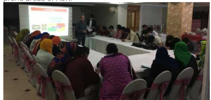
Disaster Management Training 15 June, 2017, Muzaffarabad AJK

hit communities. KIIR is primarily focusing on building capacity, implementing best practices, and generating knowledge regarding disaster management in disaster-prone areas of AJK.