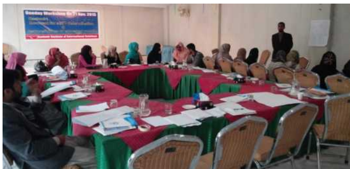
Oneday Workshop with Kashmiri Youth on 21 Nov, 2015

A large population of these migrants are young people. Scars of a troubled past are visible on those young men and women who migrated from Indian-held Kashmir after 1989 or were born in families who migrated in that period. Since they are recently divided from their families, the sense of deprivation and grief is more intense within them. Human rights abuses in Indian-occupied Kashmir and denial to a way forward for a peaceful resolution of the Kashmir issue has aggravated their frustration. Young women and men from migrated communities are particularly affected by multiple challenges at all levels. In order to mitigate the challenges KIIR has been working with young women and men who grew up in refugee camps for many years. The series of consultative workshops in previous years provided spaces for dialogue on ways for peaceful conflict resolution, peace building, human rights and advocacy. The major focus was skill building of potential youth and their involvement in advocacy of human right abuses with