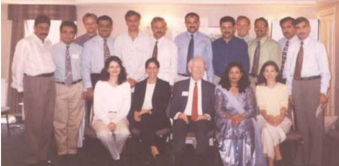
Institute of Multi-Track Diplomacy (IMTD) Washington

KIIR understands the importance of individuals, systems and initiatives that are empowered enough to tackle complex peace-related issues. That is why it has taken pioneering initiatives to build capacities of political leaders, business