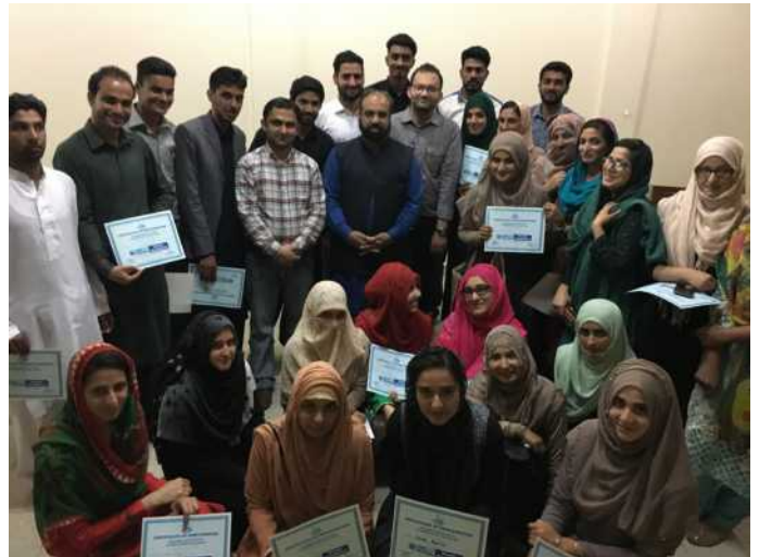
Disaster Management Training, 24 March, 2017, University of Kotli AJK.

KIIR believes that it is essential to equip local communities with knowledge and skills, to handle conflict-based crises and natural disasters. During the past twenty-five years, this component of KIIR's program has initiated a wide spectrum of activities starting with disaster preparedness and mitigation, and moving on to response in disaster-