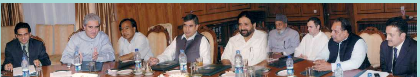
Kashmiri Delegation meeting Foreign Minister, 8 August, 2008