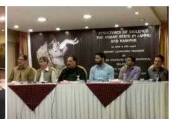
Report Launching Program at Regency Hotel, Islamabad