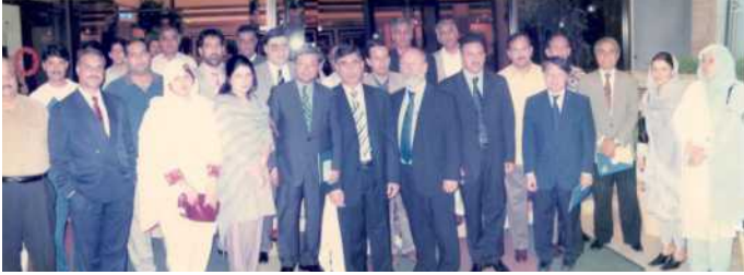
Group photo with foreign delegation hosted by KIIR

Over the years, KIIR has strengthened and expanded voices for peace by increasing support for civil society's participation. Through dialogues, collaborations and awareness raising initiatives - men and women have been involved in peace building work. For greater representation,