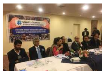
Seminar at Islamabad Hotel on 13 Dec, 2017