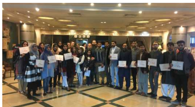
Disaster Management Training 2ndDecember 2017, Mirpur AJK

KIIR is working with local disaster management institutions (SERRA and others) and education institutions by establishing partnerships and engaging youth groups. The program has enhanced transfer of DRR knowledge among professionals and academics. Such collaborations have enhanced exchange of knowledge, resources and ideas. Because of KIIR efforts, many partnerships have been formed between academic institutions, government departments and communities, thus creating new and successful models of Public-Private-Partnerships in the discipline of DRR.