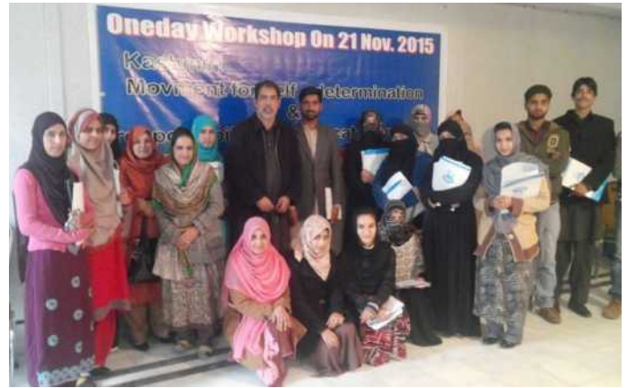
Oneday Workshop with Kashmiri Youth on 21 Nov, 2015

the Kashmiris by the authorities especially in IoK. This methodology mobilized the youth towards peaceful means rather than adopting violent behaviours. Now there are many youth in AJK who are pro-active agents of peace in their communities, in their schools and work places.