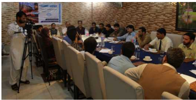
Capacity Building Workshop of Refugees on 27 August, 2016

KIIR believes that young people, as members of a dynamic group, can play a crucial role in positively transforming conflict situations and in building the foundations of democratic and peaceful society. Displacements across the Line of Control (LoC) have been a permanent issue since 1947. There were several waves of migrations in 1947, 1965 and then after 1989 which is continuing until today. According to AJK government figures, there are around 15,000 families (45000+ people) of migrants, majority of which are living in camps established by the government of AJK in Muzaffarabad, Poonch and Mirpur divisions. Government of Pakistan, Azad Jammu and Kashmir are taking care of these camps. Governments of AJK and Pakistan and some non-governmental organisations are contributing to their wellbeing.