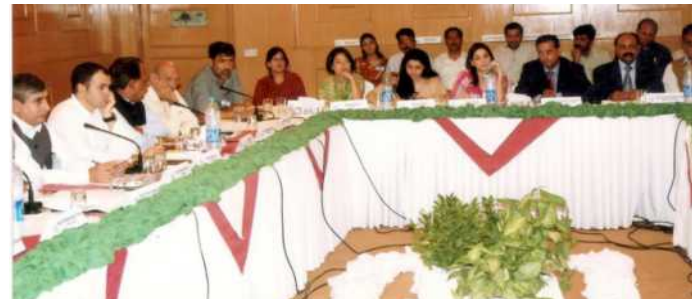
Intra Kashmir Leadership Conference on 7th Aug, 2008

During the past twenty-five years, KIIR endeavoured to bring on board, Kashmiris of all identities and ideals from both sides of the line of control, and around the world, in order to build bridges to explore possibilities of peace.