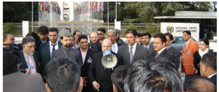
Protest outside UN Geneva 2010

Human rights advocacy is the cornerstone of KIIR's work for peace building and giving voice to the voiceless. The Human Rights Desk at KIIR regularly monitors, documents and disseminates information about incidents of human rights violation in Indian occupied Kashmir to the United Nations Special Rapporteur, United Nations Human Rights Council, and Office of the High commissioner on Human Rights, global think tanks, human rights watchdogs and other stakeholders. Since 2005, KIIR has been regularly publishing yearly and quarterly reports, pamphlets, and handbills on human rights violations which are widely circulated and appreciated at national and International level. KIIR delegation regularly attends sessions of Human Rights Council in Geneva and has developed a close liaison with UN agencies.