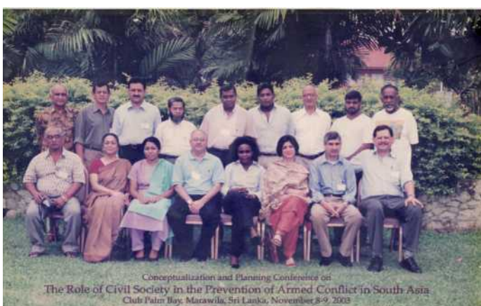
KIIR Delegation to Srilanka, 8-9 Nov, 2003

informing policy-makers about perspectives of Kashmiri communities, KIIR tried to address a key gap. This has resulted in greater openness of decision-makers, socio-political leaders and academics for engagement with indigenous Kashmiri perspectives. KIIR reached out to almost every tier of political and social spectrum in Azad