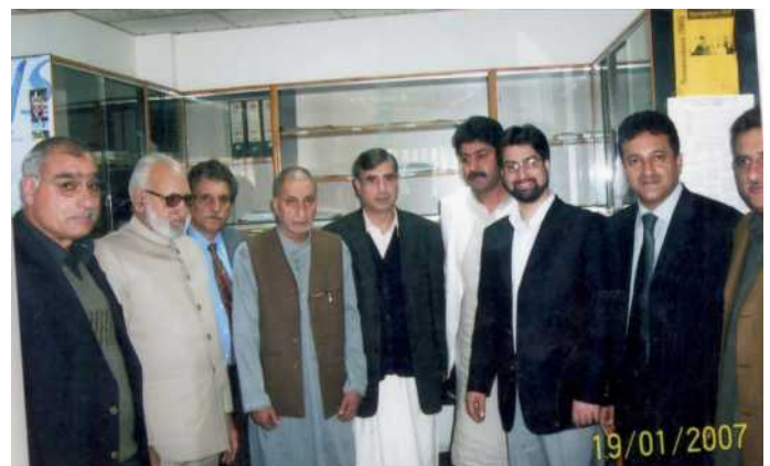
Hurriyat Leaders visit to KIIR on 19 Jan, 2007

From facilitating dialogues on educational curriculum to generating platforms for a stronger Kashmiri voice, KIIR brought diverse opinions forward to influence perspectives.