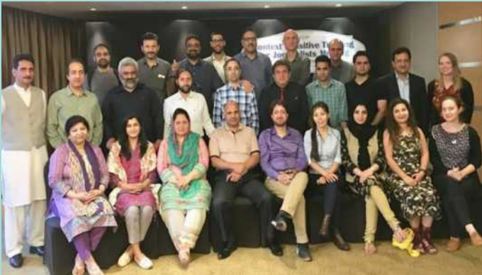
Intra Kashmir Media Conference 23-24 Jan, 2018

On the other hand, we endeavoured to develop platforms for capacity building of civil society and local communities. We engaged international institutions in dialogue processes to exchange views about lasting peace and prosperity. It was only because of our efforts during past twenty-five years that many international organizations, human rights groups, advocacy associations and activists had been mobilized to play an effective role in resolution of the Kashmir conflict. Here is a glimpse of the achievements that we have made in the past twenty-five years.