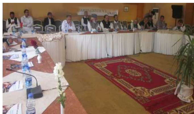
All Parties Conference 22nd May, 2014

For greater awareness, KIIR organized workshops and training programs for young political leaders in AJK. Efforts were made to create consensus on issues of significance, with reference to the Kashmir conflict. A landmark conference was organized in Dubai in 2017 that brought together all political parties in pursuit of finding viable solutions to the simmering conflict and express their feeling on the human rights situation of Indian occupied Kashmir.