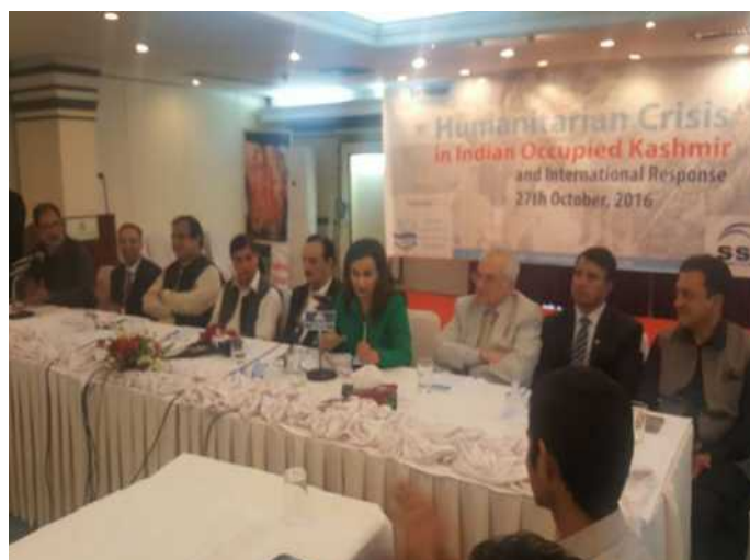
Workshop on Humanitarian Crisis & International Response on 27th Oct, 2016 at Islamabad Hotel

institutions, government departments, NGOs and cultural groups. The trust and confidence of local communities and institutions is a precious asset for KIIR that it had earned through sheer commitment and focus on peace objectives.