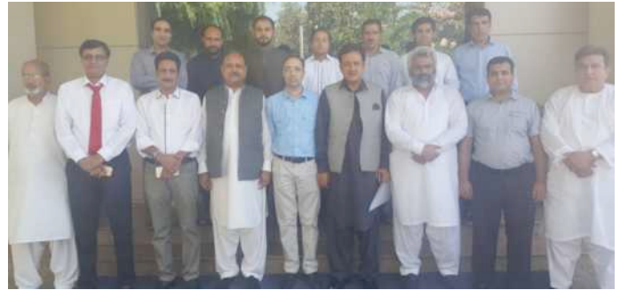
Kashmiri Journalist Meeting 2016, Islamabad.

An efficient, well-resourced media is crucial for safeguarding of peace. While there is increasing recognition of media and its positive and negative potential in relation to Kashmir conflict, there is relatively little accessible evidence on what works, guidance for journalists, or attention from policy makers.