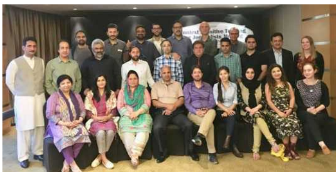
Intra Kashmir Media Conference 22-23 March, 2018

KIIR has built upon various social and cultural traditions to promote harmony at the grassroots level. In this way, KIIR laid the foundation for creating a more diverse, more sustainable culture of dialogue. KIIR's approach was to develop a cadre of next-generation Kashmiri leaders who are committed to transform the political, social and spiritual dynamics of the region and build momentum for peace on an incremental basis.