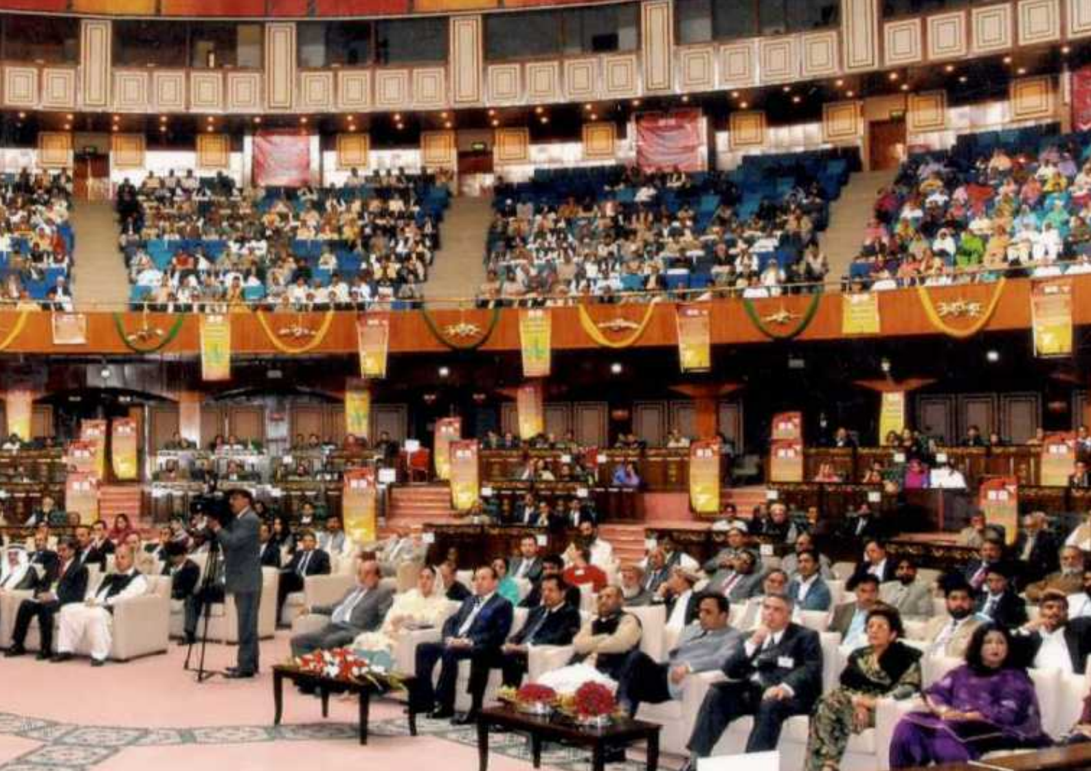
International Kashmir Conference Organized by Institute of Strategic Studies & KIIR, March 16-17, 2007