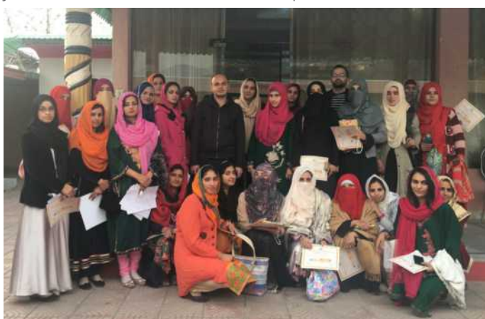
Disaster Management Training, 9 December, 2017, Bagh AJK

The primary beneficiaries of this program are youth of AJK, particularly those studying in universities. It has been observed that youth in AJK lack knowledge, skills and platforms to act as first response in any type of disaster. Therefore, KIIR is making efforts to develop a cadre of equipped and motivated men and women that can quickly join hands with local disaster response mechanisms as