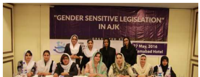
"Gender Sensitive Legislation in AJK" workshop, 27th May, 2016 at Islamabad