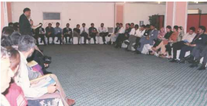
International Center for Religion and Diplomacy (ICRD), Bhurban

people, journalists, human rights activists, lawyers and other professionals, particularly in the field of leadership, peace building and negotiation skills. Through training workshops and exposure visits to various individuals, institutions and organizations, KIIR has broadened the scale of trained leaders in Kashmir that are more aware in different styles of interest-based negotiation, as well as general rules of diplomatic protocol, and multilateral