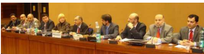
UN Human Rights Council, Geneva 2011