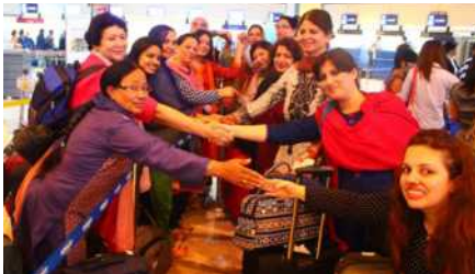
Cross LOC Women Meeting, 2014

KIIR is committed to empower women in the AJK region. The gender component, which was considered as a crosscutting theme, has emerged as a direct focus area. It is now working as a full-fledged component having multiple prongs of grassroots interventions designed to enhance women's social, economic and political participation in Kashmir. The organization had undertaken several activities over the years to create an enabling environment for