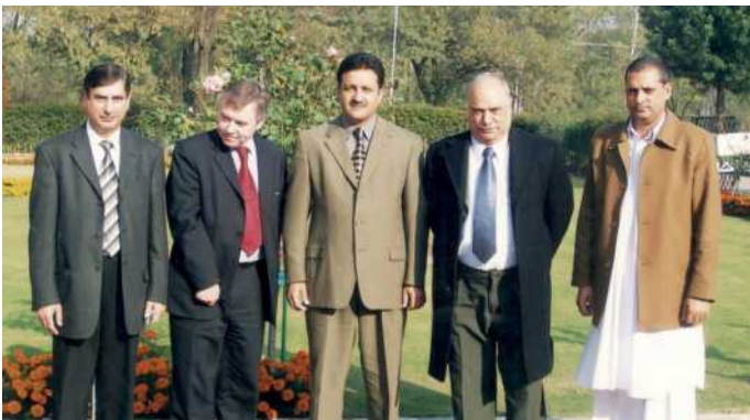
Kashmiri delegation with I.W. Jones, Wales Assembly, 3 January, 2005

KIIR has strengthened youth groups, promoted women's dialogue processes, increased skills of media professionals, deepened ties between business groups as well as new target groups, particularly those involved in rehabilitation of displaced families and communities affected by various forms of crisis.