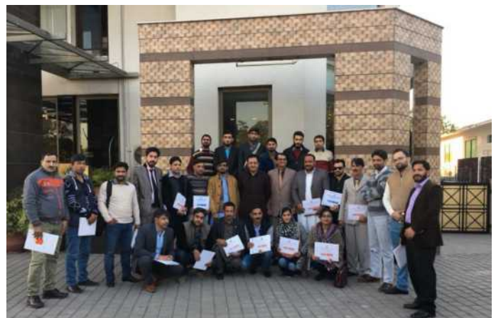
Journalist Workshop at Regency Hotel, 2018

organization is empowering journalists to present the true picture of ground realities Likewise, KIIR is facilitating media to disseminate reliable information about Kashmir conflict; and represent a range of views sufficient for communities in this region to make well-informed choices.