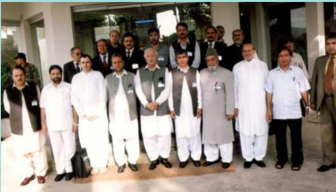
1st Intra Kashmir Leadership Conference on Aug, 2008