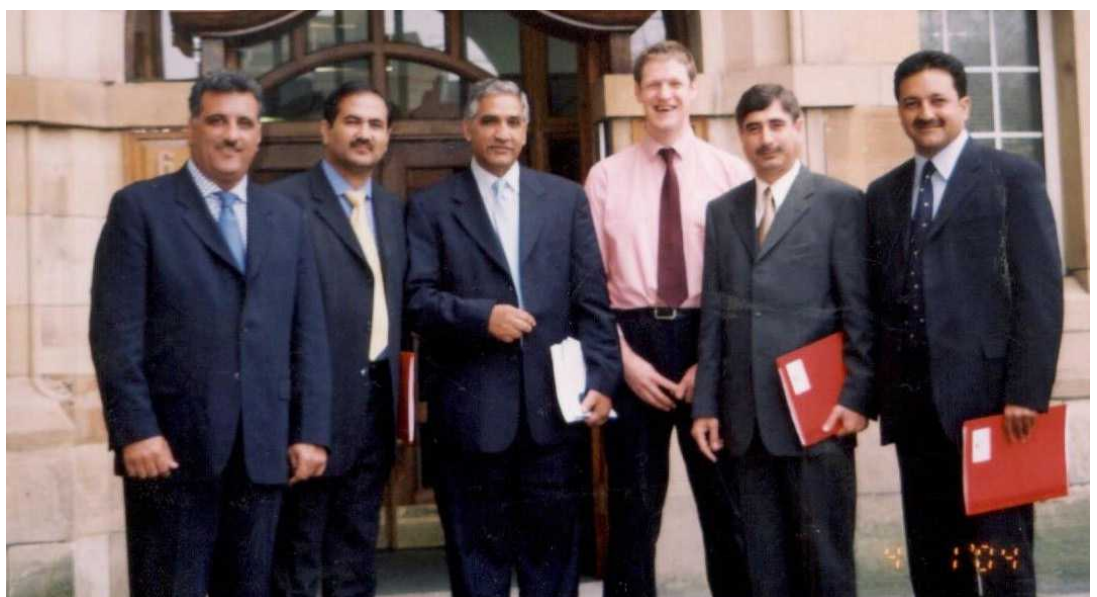
KIIR Delegation Visit to Northern Ireland 2004

Washington DC, International Centre for Religion and Diplomacy, Washington, DC, United States Institute for Peace, Centre for Strategic and International Studies- Washington DC, Henry L Stimson Centre- Washington, DC, Muslim Judicial Council- South Africa, Human Rights Foundation- South Africa, and the Institute of Culture and Languages- Vienna.