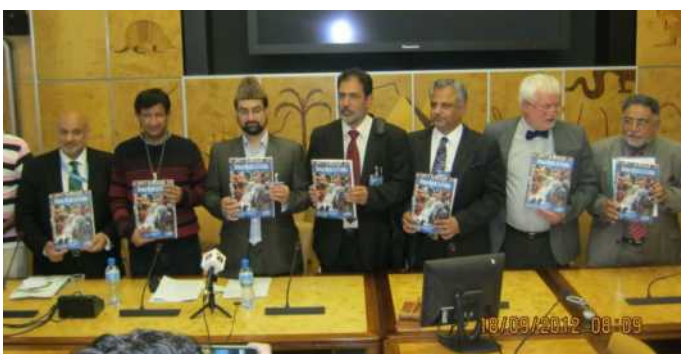
Report Launch at UN Geneva on 18th Sep, 2012