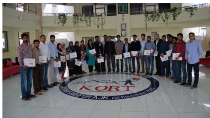
Disaster Management Training, 11 March, 2018, Mirpur AJK

The component has particularly benefited education institutions in AJK where youth-groups have been mobilized to vigilantly look at local demographic, political and environmental conditions; and prepare plans for disaster response. Such initiatives have promoted an atmosphere of healthy activities in education institutions by providing the students with opportunities to learn and employ new skills.