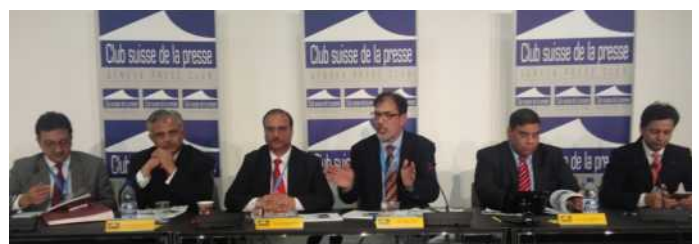
Kashmiri Delegation members addressing Press Conference in Geneva Press Club, Sep, 2014