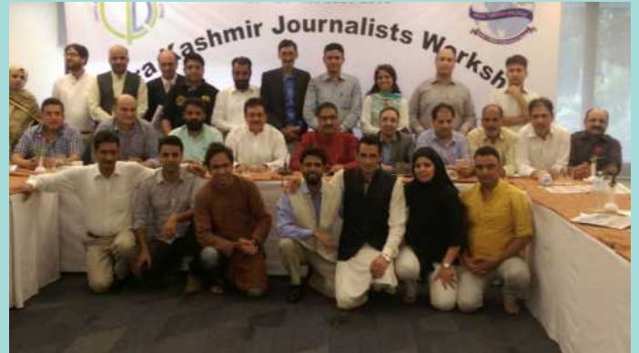
Intra Kashmir Media Conference 23-24 Jan, 2018