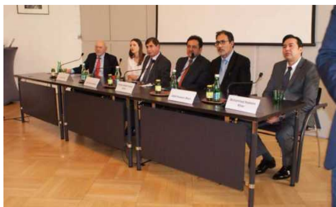
Kashmir Conference Vienna 2003

institutions, government departments, NGOs and cultural groups. The trust and confidence of local communities and institutions is a precious asset for KIIR that it had earned through sheer commitment and focus on peace objectives.