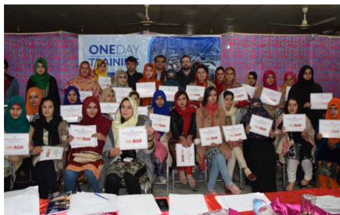
Disaster Management Training, 3 March, 2018, Bagh AJK

volunteers, when a crisis hits. Availability of trained youth in disaster response techniques have enhances resilience among communities for disaster response. It has created safer neighbourhoods and increased sense of ownership among members of the community by generating discourse on local vulnerable groups and structures.