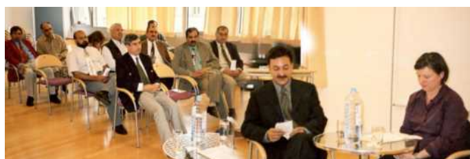
Kashmir Conference Vienna 2003

Kashmir in the past twenty-five years including political parties, think tanks, universities, human rights activists and