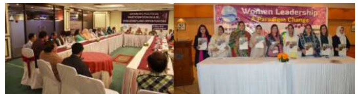
Women Workshop held in Islamabad Hotel on 27th May, 2016

With these and multitude of other interventions, KIIR has strengthened women's voices, and provided a platform to harness enhanced recognition and receptivity for women's participation in social, economic and political affairs, equally, freely and meaningfully.