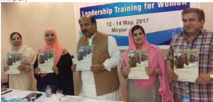
Report Launch "Voices Unheard, Stories Untold: The Plight of Women in Neelum Valley - AJK, May, 2017 at Mirpur

2017-18: 4 Leadership and conflict Resolution trainings, for young women (Islamabad, Rawlakot, Muzaffarabad, Mirpur)