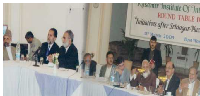
AJK Leadership Conference 13 March 2005 Islamabad