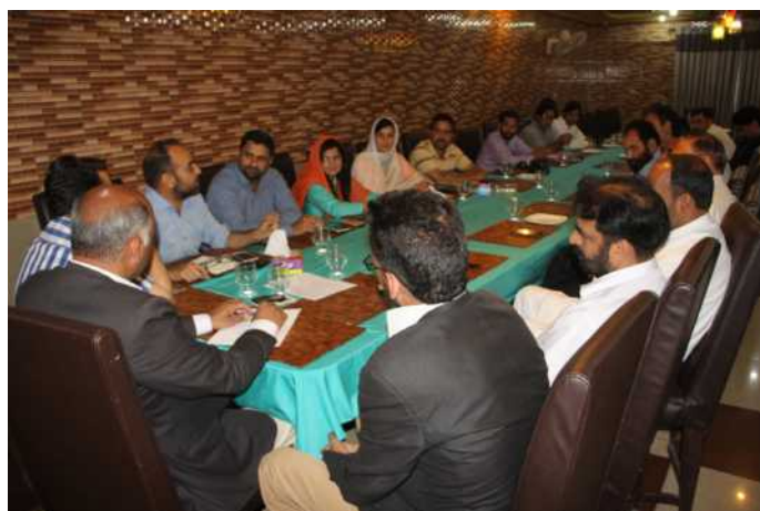
Journalist Workshop at Muzaffarabad, April, 2018

With support from KIIR, journalists in AJK had the opportunity to interact with senior journalists of Pakistan in Lahore. We also facilitated many journalists to get membership of 'All Kashmir Newspaper Society' (AKNS). In the last quarter of year 2017, KIIR launched a new set of training program for young journalists of AJK who never had an opportunity to learn and lead in their field. This initiative was highly appreciated by the journalist community and the various government departments who are linked to this area of interest. The feedback of these trainings has been very positive. Based on the positive feedback, KIIR is planning to further extend its outreach to those media actors that need capacity-building support for improved performance.