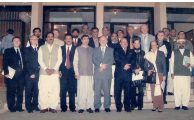
Foreign diplomats hosted by KIIR

Over the years, KIIR has mobilized hundreds of leaders and thousands of peace activists by providing them training, information and linkages. This has enhanced the prospects for lasting peace in Kashmir through inclusion of Kashmiri voices in the peace process as well as transforming relationships across various communities. Initiatives like 'Kashmir Conflict Transformation Workshops' were